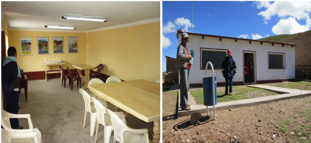
Reconditioned Community Center, January 2012

68. The foregoing activities not only evidence the different commitments that the Company undertook and fulfilled, but also show the collaborative atmosphere that existed at that time between the Company and the communities, as well as the communities' interest in the continuation of the Project.