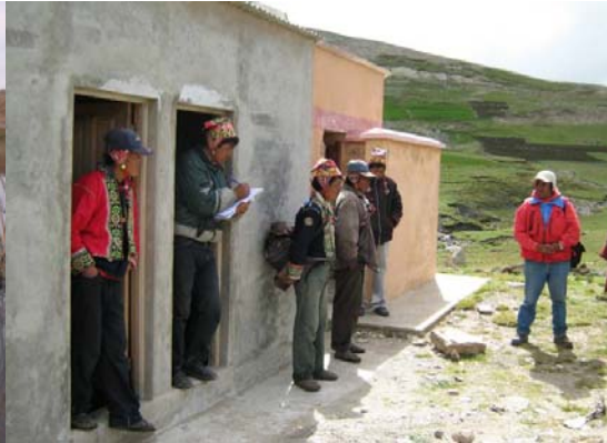
Construction of bathrooms in Kalachaca

52. Bolivia alleges that the Company’s contribution of a chapel to the Kalachaca community (as well as similar contributions) was not a “real benefit.” 100 First , this contribution was made in response to a specific request received by the Company in May 2007. 101 The materials required for the chapel (including size and specifications) were provided by the Kalachaca community. 102 Second , this request was one of the first made by the communities, which is why it was particularly important for the Company. Lastly , the Government was satisfied with CMMK’s contributions: CMMK informed the Government about this and other contributions to the communities and the Government never provided any negative comments regarding any of them. 103