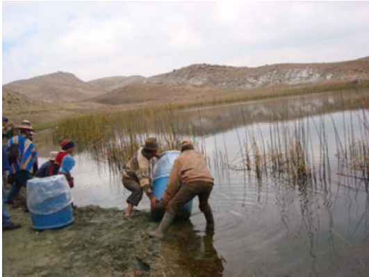
Trout farming, September 2007