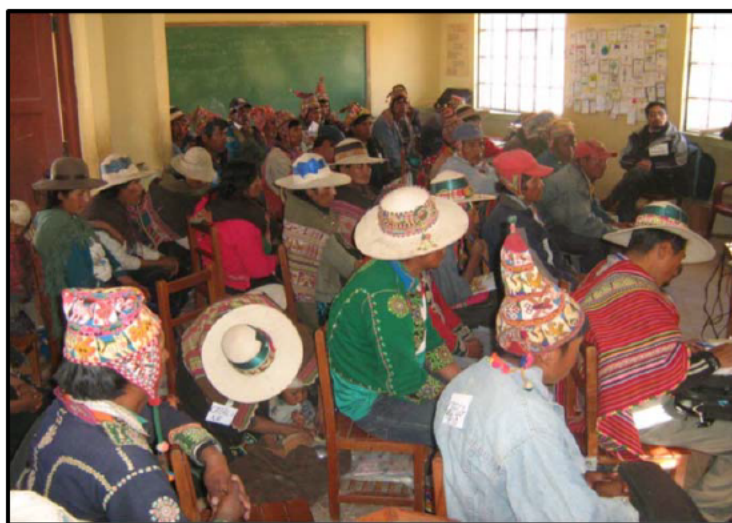
Workshop “Conociendo la Minería” at Ayllu Tacahuani