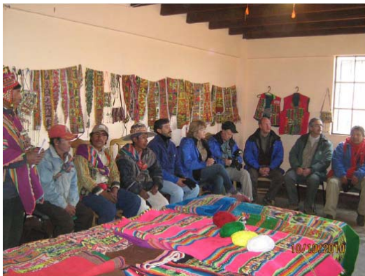
Arts and crafts fair in Malku Khota with Company officials, December 10, 2010