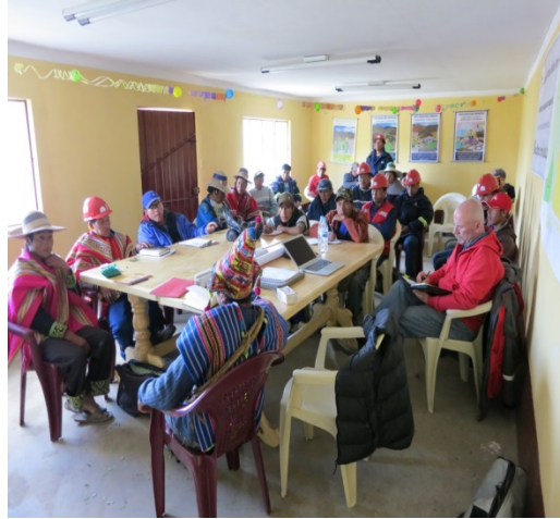
Grievance mechanism workshop, February 2012