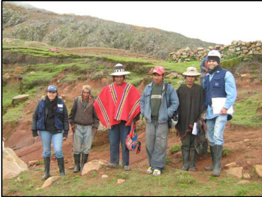
Kalachaca community members with Fundación Medmin representatives taking samples from Malku Khota and Wara Wara, February 2009

34. In June 2008, the Company retained Cumbre del Sajama, a Bolivian firm specializing in consulting services to the mining industry. 53 Cumbre del Sajama was specifically retained to support the Company's community relations efforts. Part of this support entailed conducting workshops ( talleres ) in different communities. The purpose of these workshops was to reinforce community relations and to educate the communities on the social, mining, and environmental aspects of mining and the Malku Khota Project. 54