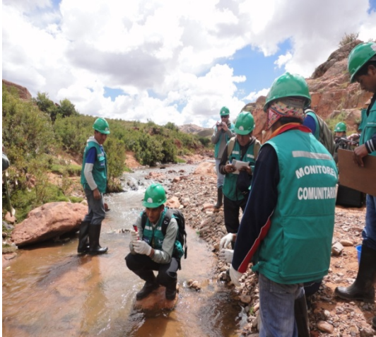
Environmental monitor training program, March 2012