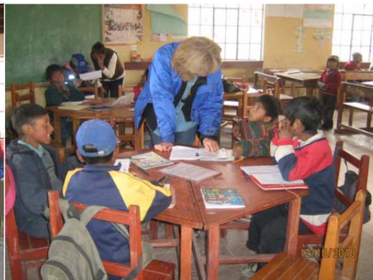
Education and environmental program in Kalachaca School, October 12, 2010