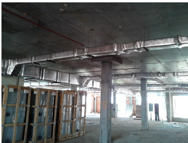
Photograph of the worksite taken on January 14, 2015