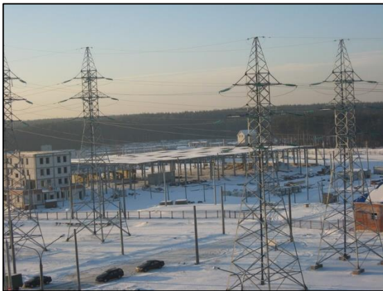
Depot View as at 13 January 2009