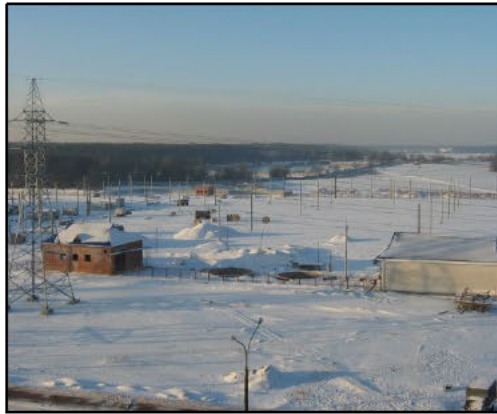
Depot View as at 13 January 2009