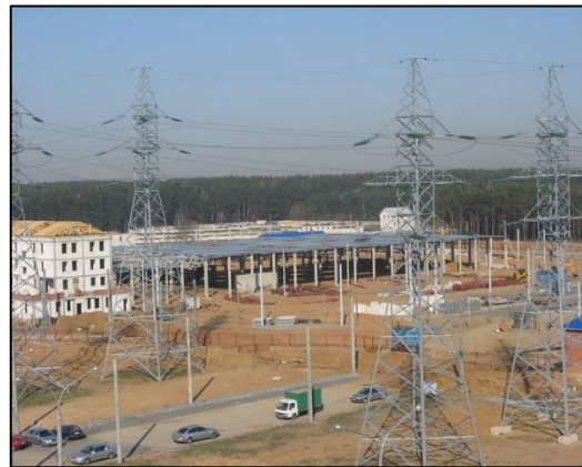
Depot View as at 23 April 2009