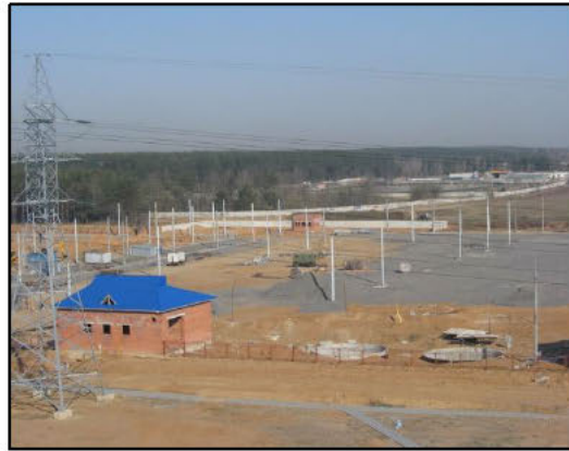
Depot View as at 23 April 2009