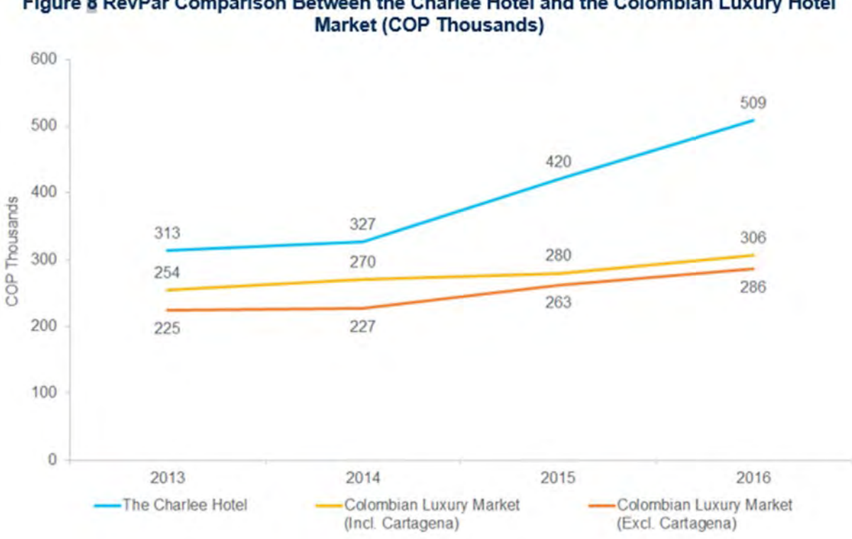
Figure 8 RevPar Comparison Between the Charlee Hotel and the Colombian Luxury Hotel

highly profitable. The hotel was one of the first of its kind in Medellín, and soon outstripped performance not just with respect to the local market, but Colombia as a whole. The hotel's occupancy rates in 2017, for example, were between 70 and 80 percent compared to average rates in Colombia that hover between 50 and 60 percent. 1049 Moreover, the Charlee Hotel captured revenues per available room ("Revpar") that were significantly above the average for luxury hotels in Colombia. 1050 The Charlee Hotel even outperformed resort hotels in Cartagena, Colombia's premier tourist destination with luxury hotels that significantly outperform their counterparts in Bogotá and Medellín. 1051